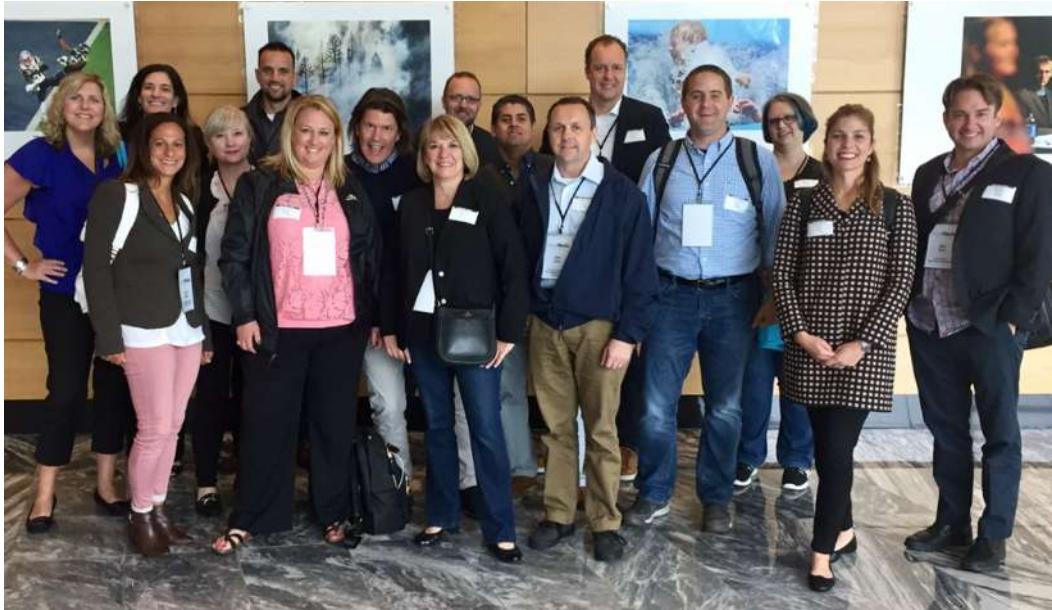
Innovation Mission Participants at Gannett – May 2017